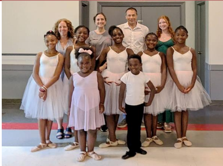
Students and teachers from the 2023 recital.