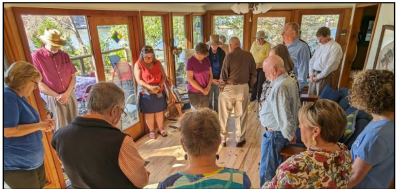
Prayer during the Holy Chow gathering Oct. 29th. See more on pg. 3

What is God calling you to do and to be in this body of Christ? That's your ministry, and it matters.