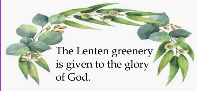
The Lenten greenery is given to the glory of God.

Have a special event or a tribute you'd like to make to a loved one? Make an altar flower dedication and let us all know what is dear to you. It's $40 and you can specify your preferences. During Lent, we have greenery.