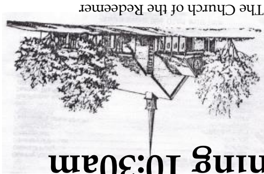
The Church of the Redeemer

Christmas Eve 5:30pm and 10:30pm Christmas Morning 10:30am