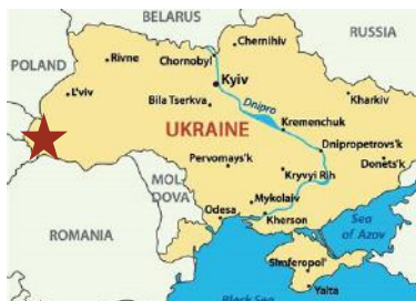
★ Uzhgorod, Ukraine

business acumen resulted in bankruptcy. She has asked us to help her re-establish the business and we placed a condition of our involvement that she receives Christian business training through a Christian Finance Club run through our lead church. This Finance Club has agreed to mentor her but shared that such training is done better within a group that shares their struggles and successes together. So, we pitched the idea to the Roma Church of Jesus Christ who immediately recruited six other people from their church who wanted this training in Christian business practices. This is another example of "bringing people together to help the oppressed."