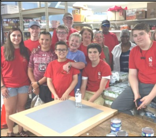
SOS at Samaritan House on Thursday. What a fun week of service we had! It was a blessing for all who participated.

Please join us on Sunday for our 9:30am service with coffee hour to follow.